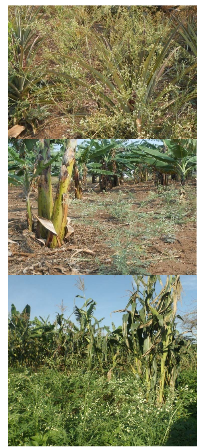
(a) Pineapple, banana and Maize fields infestation

along the road in three locations (p<0.05) (Fig. 2). The findings of this study indicates that parthenium weeds invaded crop lands, grazing lands, residential areas and along the roadsides.