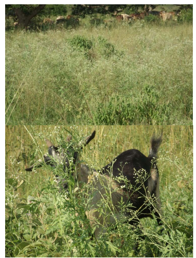
(d) Grazing land infestation