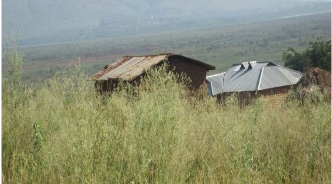
(b) Residential area infestation