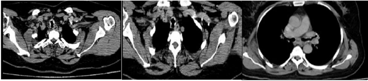
Figure 1: Thorax-CT images of the patient on admission