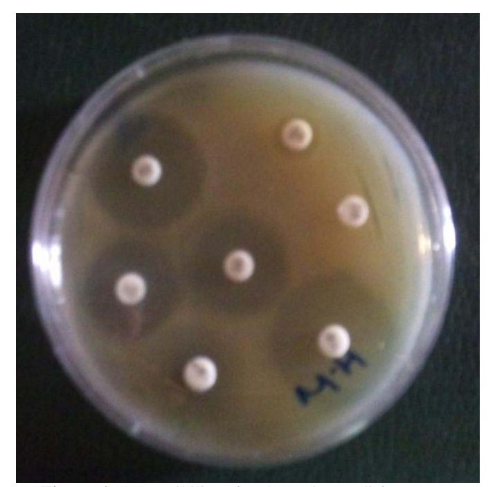
Figure 6: Susceptibility of pathogenic E.coli for seven common used Antibiotics