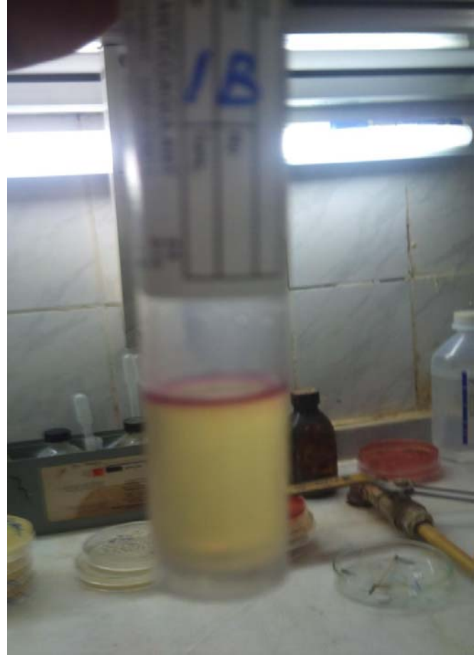
Figure 3: Positive indole sample (red surface layer)