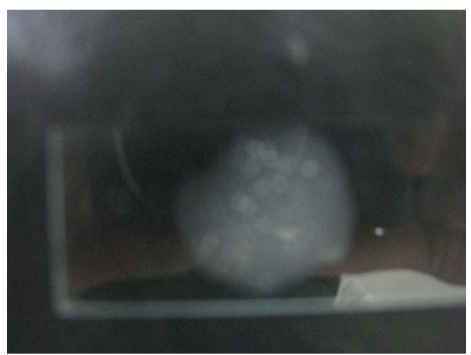
Figure 4: Clumping of bacterial cells on slide as a result of reacting with antisera