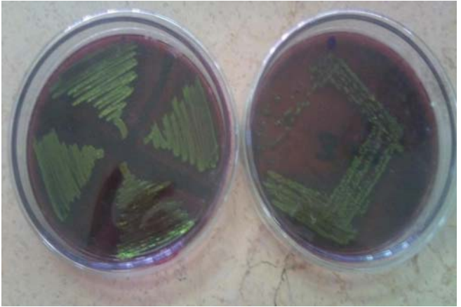
Figure 1: Samples cultured on EMB media shown metallic green E.coli colonies