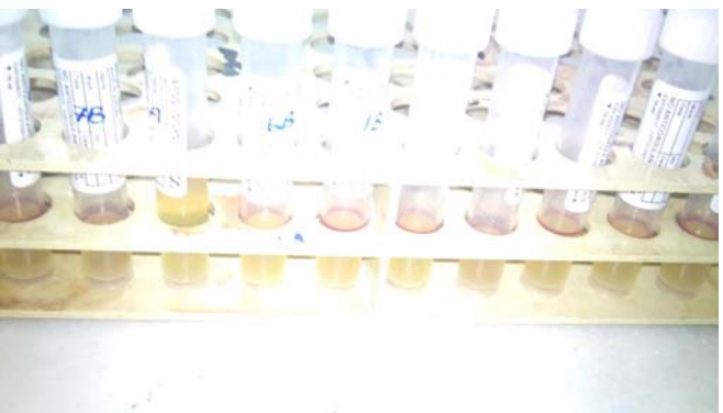
Figure 2: Testing samples for indole production