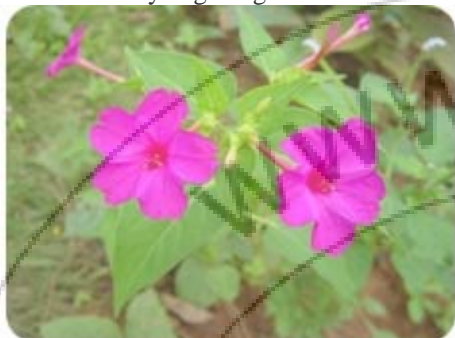
Plate: 1 Mirabilis jalapa flower

Colors obtained after dyeing are given below.