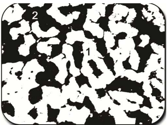
Figure 1: C. S. of adrenal gland showing interrenal and chromaffin tissue (24 weeks). ImageJ version 1.47 i 1. Interrenal tissue 2. Chromaffin tissue