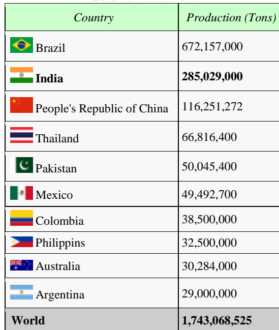
Table 2: In India