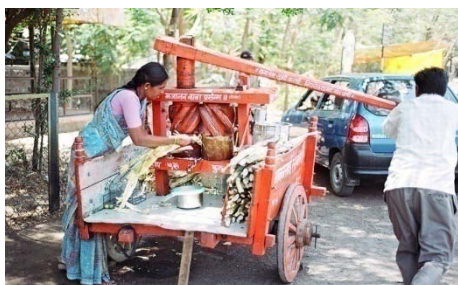
Figure 4: Sugarcane juice extraction by vendor

Different types of sugarcane juice machines available in the market are: Big Type Sugar Cane Juicer Machine, Cane Juice Four Roller Extractor, Cane Juice Machine, Cane Juice Wheel Concentrate, Cane Juicer Wheeled Machine, Cane Machine, Cane Manual Juicer Machines, Cane Small Type Juicer Machine, Cane Three Roller Appliance, High Quality Sugarcane, Fresh Sugar Cane Business, Hygienic Sugar Cane Juicer, Stainless Steel Sugarcane Crushing Rollers, Sugar Cane Chilled Squeezed Machine, Sugar Cane Chilled Squeezed Machine, Sugar Cane Gear Wheeled Extractor, Sugar Cane Three Roller Presser, Sugarcane Horizontal Domestic Machine, Sugarcane Juice Producer, Table Top Sugarcane Trendy Juicer, Big Sugar Cane Crusher, Box Type Cane Crusher, Cane Large Chiller Cum Crusher, Heavy Duty Sugarcane Crusher, Sugar Cane Chiller Cum Crusher, Sugar Cane Juice Concentrate, Sugar Cane Squeezebox Press, Sugarcane Crusher, Sugarcane Crusher