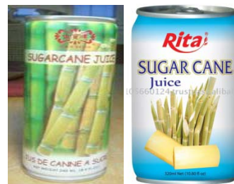
Figure 2: Packed Sugarcane juice

Vietnam. It is the national drink of Pakistan, where it is called "roh" and sold fresh by roadside vendors only. In Egypt, sugarcane juice is an incredibly popular drink served by almost all fruit juice vendors, who can be found abundantly in most cities. In both Indonesia and Malaysia, sugarcane juice is sold nationwide especially among street vendors. It is also bottled for local distribution in some regions and sold at food courts daily. In Singapore, it is sold in food courts only.