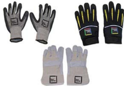
Figure 6: Leather gloves

The first step in eliminating hazards to the arms, hands, and wrists is education. The workers need to be informed about the proper ways to operate a machine, and things to be done in case there is a problem. This could include proper instruction on areas not to touch on the machinery without gloves, as well as proper placement of the hands to ensure they are not injured.