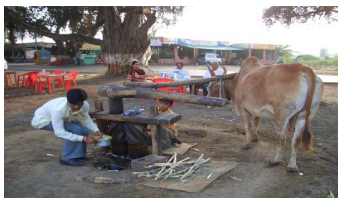
Figure 3: Sugarcane juice extraction with the help of bullocks

Sugarcane juice is not the new invention. Even in the past sugarcane juice is extracted from the sugarcane with the help of bullocks which is the traditional way of extracting juice from sugarcane. It is mostly seen in Rajasthan. Earlier humans also used the traditional sugarcane juice machine to extract juice by rotating it by themselves.