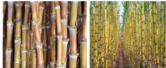
Figure1: Sugarcane Stalks

merchants began to trade in sugar - a luxury and an expensive spice until the 18th century. Before the 18th century, cultivation of sugar cane was largely confined to India.